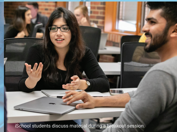
iSchool students discuss material during a breakout session.

Digital humanities is not a field with crisp boundaries. The label covers a range of activities that use digital technology to express, preserve, or understand human history and culture (or that critique digital technology itself). Data curation, digital scholarship, and data science, for instance, may be described as “DH” when they address humanistic material or problems.